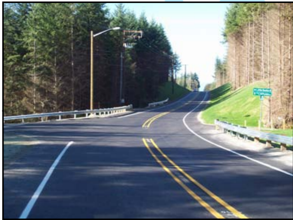
Cliffside Road Project