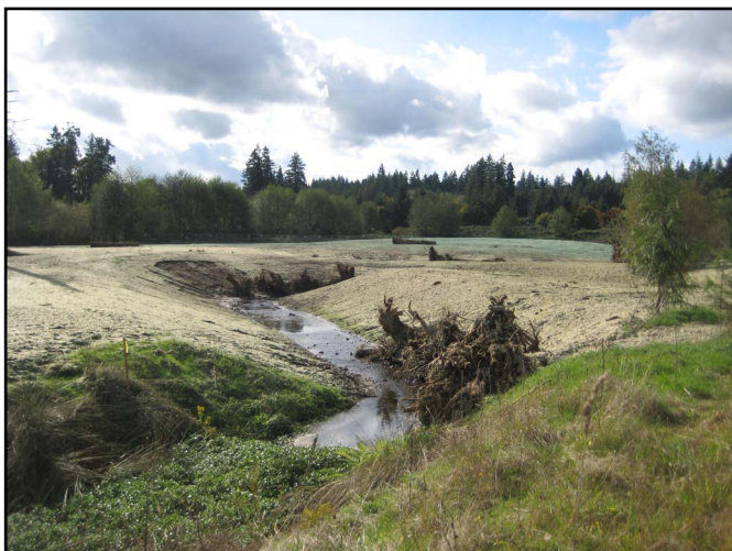
Schold Farm restoration site

Impacts due to the loss of these wetlands were mitigated through approximately 61,503 square feet of wetland creation and enhancement on the Schold Farm mitigation site. The created and enhanced wetlands are more ecologically valuable than the existing wetlands on the Community Center project site, resulting in an overall net gain of wetland functions in the Clear Creek drainage basin.