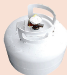
Large Propane Tanks