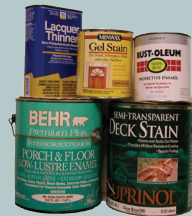
Oil Based Paints & Stains