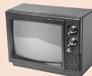
Televisions, Monitors, and other Electronic Devices